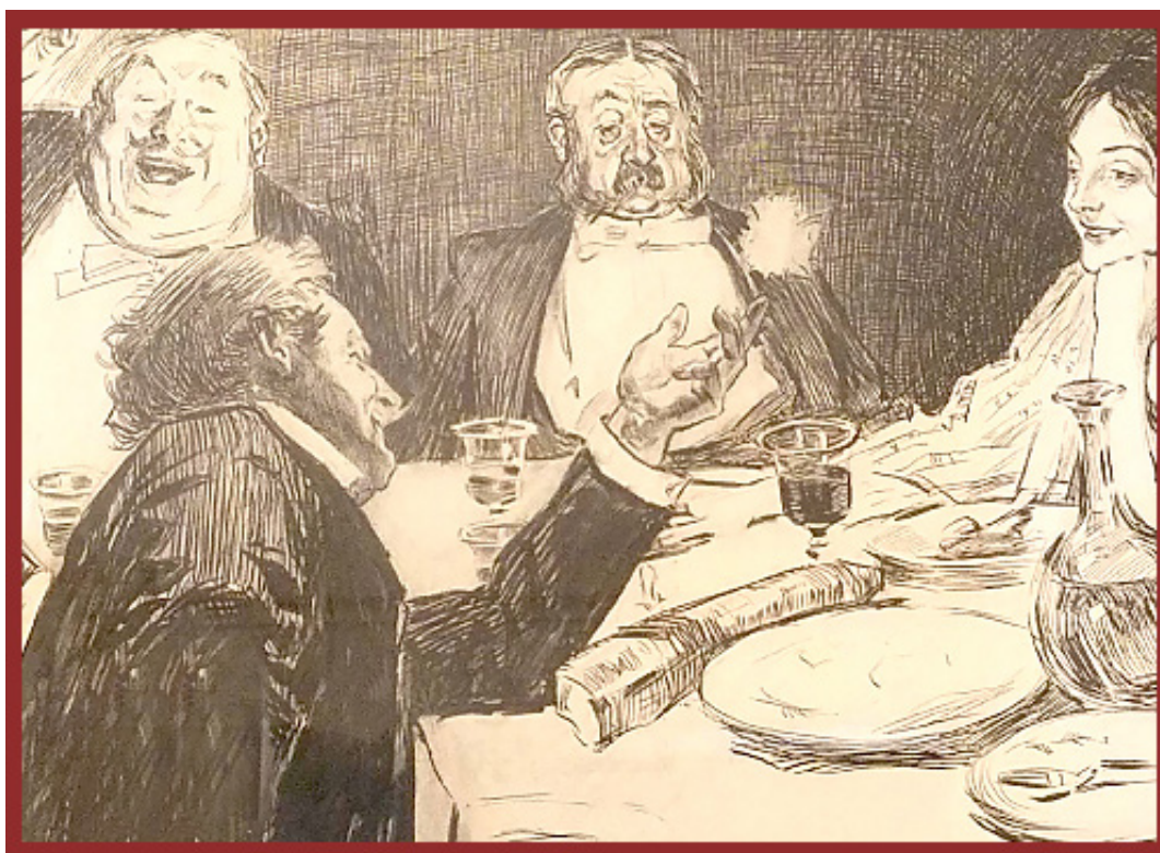
“The Dinner Party” by Charles Dana Gibson

“Even though we’re far away, Our thoughts they do pursue you. This is to say with all our Hearts, A Merry Christmas to you.”