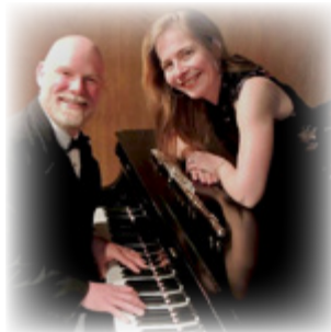
IVORY & GOLD